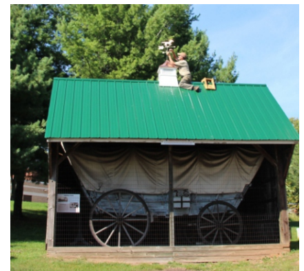
Wagon Shed with Cupola Addition