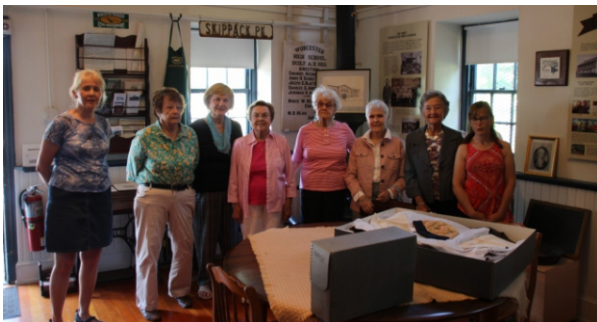
Rittenhouse Questers Grant Presentation

Worcester Historical Society has been fortunate to have received grant funding in 2022 from the Rittenhouse Questers, a locally based chapter of the National Questers Organization. This money enabled us to purchase a variety of archival quality storage boxes, in varying sizes, to permanently and safely store objects. We will be transferring our oldest and