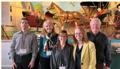
Deed Program, March 2022

The Historic Properties Survey documents historic houses, barns, out-buildings, root cellars and ice houses, to name a few, in Worcester post 1940. The survey is about 4/5ths finished with over 300 resources surveyed. The work is funded by a grant from Heritage Conservancy with the photography and documentation completed by our Society Board Members. The final project will be a wealth of knowledge about our community history. Survey results will be available at the Pennsylvania Historical and Museum Commission (PHMC), at Heritage Conservancy’s office in Doylestown, and on the Society’s website. The PHMC is the official history agency of the Commonwealth of Pennsylvania. They are responsible for the collection, conservation, and interpretation of Pennsylvania’s historic heritage.