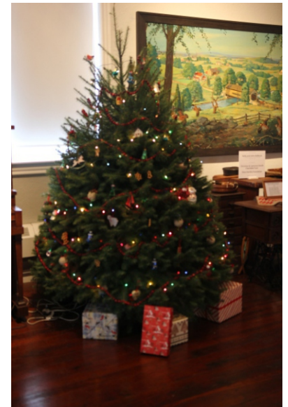
Christmas Open House

We want to thank the Christine and Lawrence Smith Family Charitable Trust, the Dave Dambly Memorial Fund, and the Mitre Box in Lansdale for the restoration.