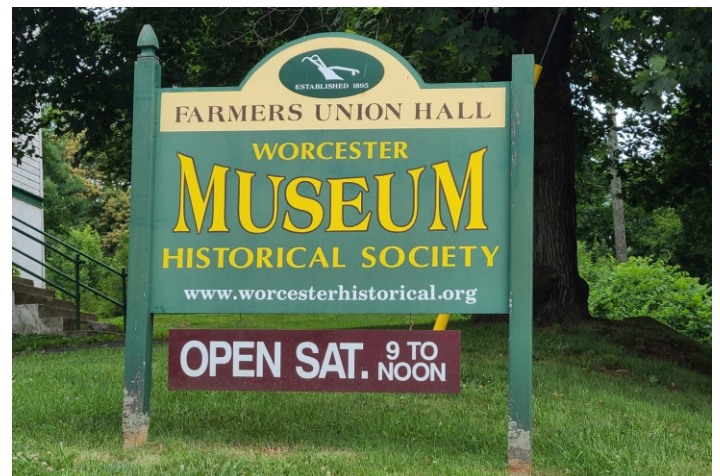
Farmers Union Hall Sign on Valley Forge Rd, 2021

Annual Antique Fair and Flea Market to be held on May 7 from 8 am to 2 pm at the Worcester Township Hall in Fairview Village. If you are interested in becoming a vendor, please check our website for further details.