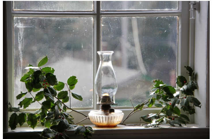
Farmers Union Hall Open House, 2021

In 2021 we started a new blog series entitled "Did You Know" to keep residents informed of underreported or forgotten historical events and places. First in the series was the WW I & WWII monuments and their history. This was followed by brief, individual biographies of those who made the ultimate sacrifice in both wars. Just tap "blog" on the website; Worcesterhistorical.org or our Facebook page. In 2022, we intend to explore additional, little know or forgotten facts that you will find of interest.