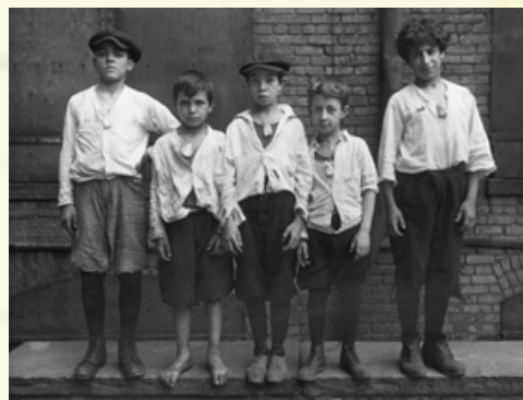
Boys wearing bags of camphor.