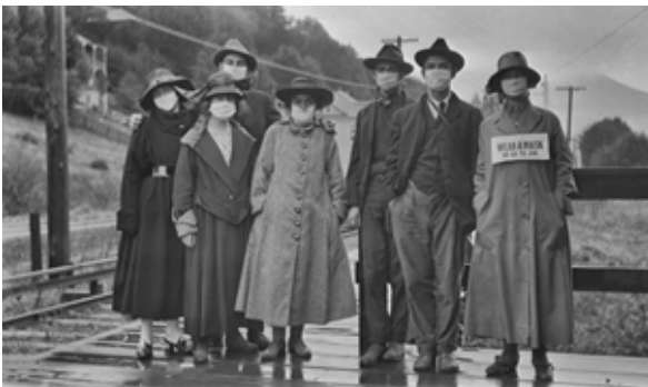
Sign reads "WEAR A MASK OR GO TO JAIL"

One of the first mentions of the flu was April 5, 1918 with 18 cases in Haskell Kansas, military base. Within one week the number quadrupled. As history repeats itself, communities reacted differently. Some imposed quarantines, and shut down public places, including schools, churches and theaters. People were advised to avoid shaking hands and to stay indoors, and libraries put a halt on lending books. Cities staggered working hours to avoid a crowded commute. A few unusual preventions were wearing bags of camphor around your neck (old wives' tale), gargling with saltwater, and posted signs "DO NOT SPIT ON THE SIDEWALK", hoping the elimination of exposed expectorate would curb the spread. There was even mask shaming.